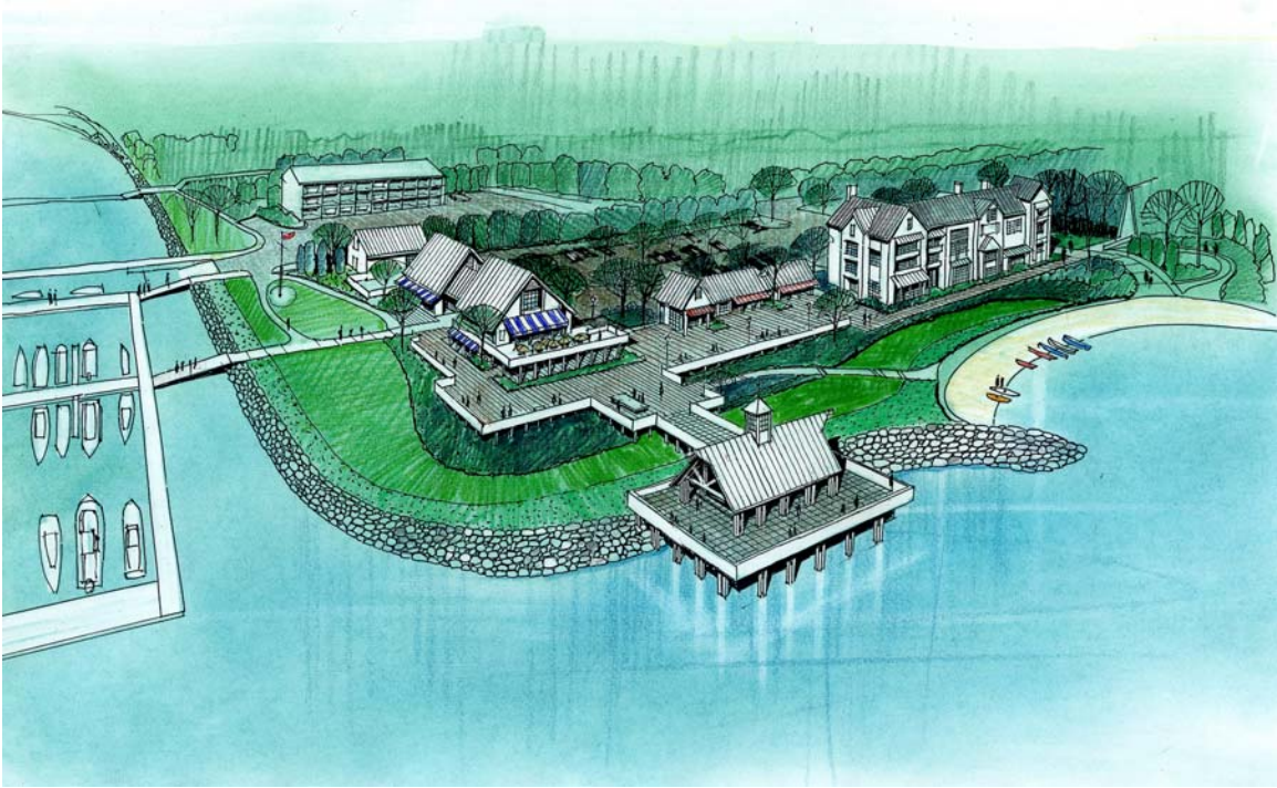
Conceptual Idea for Third Street on the Pamunkey